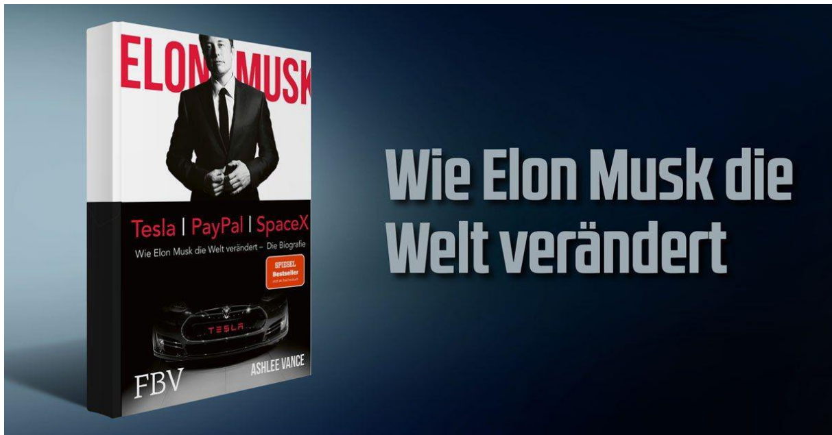
Book: How Elon Musk is changing the world.

On March 3, seven Tesla charging stations were set on fire at a shopping center near Boston, Massachusetts. A few days later, the electric car brand's store in Tigard, Oregon, was set on fire twice within a week. Windows shattered, bullets pierced the office wall, and three vehicles were damaged.