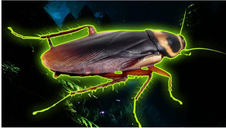
An "enlightened" cockroach

Through a remote signal, these cockroaches would suddenly activate and give off a green light as soon as they received the external pulse.